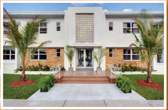
This photo: An orange wall behind the reception desk adds a burst of color in the otherwise gray and white lobby of Motel Bianco. Above, inset: The hotel's historic façade.